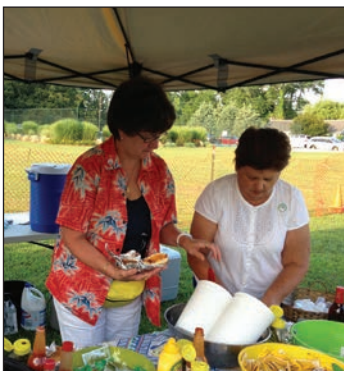
Enjoying the food!