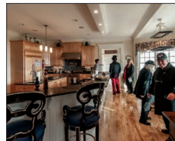
The Bolling Home