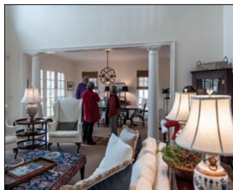
The Lawler Home