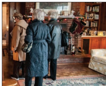
Susan Moenssens's Flowering Fields Bed and Breakfast