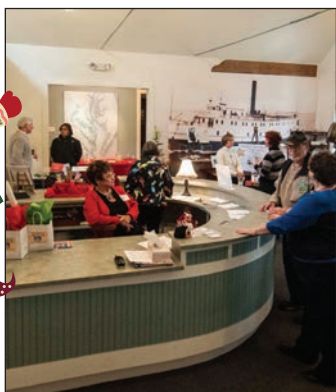
Book signings at the Museum.