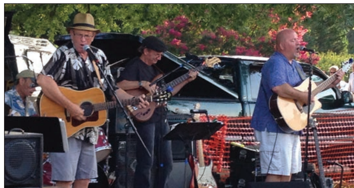
Jumbo Lump Daddy and the Backfin Boys kept the place hoppin'.