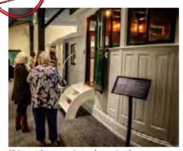
Visitors at the museum's open house view the pilothouse restoration.

At the open house visitors saw the magnificent