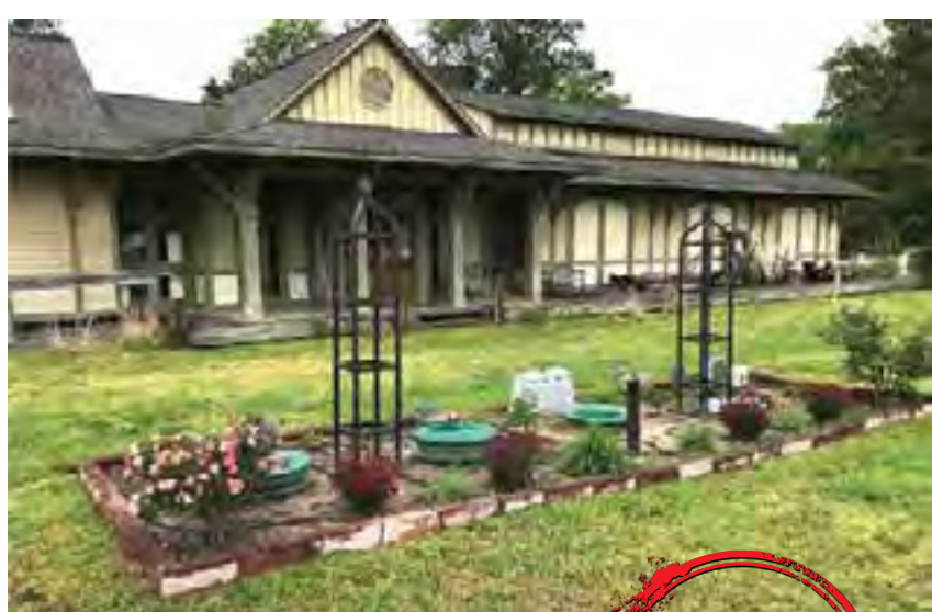
The museum's garden on its way to becoming a Victorian garden "exhibit."

Museum volunteers Mary Ann and Bob McKay designed and planted the garden. They provided the plants and sundial, built the structures and installed an irrigation system. The Garden Club of the Northern Neck also supported this effort.