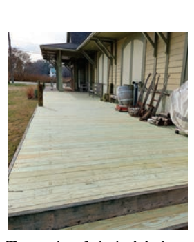
The newly refurbished deck

repairs to our museum deck and handicapped ramp, upgrades to the museum shop point-of-sale system and other projects. The Nettie Lokey Wiley and Charles L. Wiley Foundation awarded the museum $10,000, and The S. Mason and Lula P. Cole Charitable Trust awarded $10.00