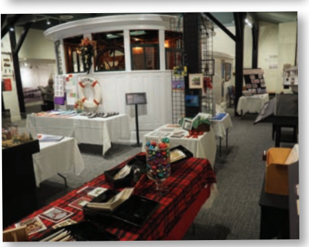
Once again the museum's Holiday Marketplace was a great success!